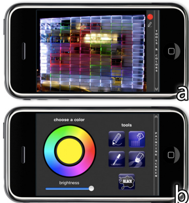
Figure 3: Users are able to switch between the façade in live video (a) and their individual tool palette (b).

temporary feedback (e.g., highlighted regions) interferes with the interaction of others. Thus, we decided to utilize the mobile display as additional, personal output canvas for individual feedback (see Figure 2). In addition, we ensured a constant control-display independent of the users' viewing distance by automatically sizing the video to show the entire interactive area.